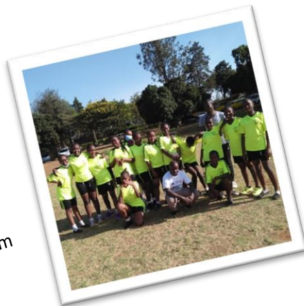
Girls Handball Team

Bronze and Silver Presidential Award – Kenya Certificates